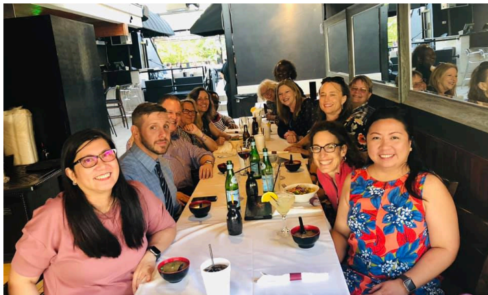
CSCPF Members dine together during the 2019 Caring for the Human Spirit Conference in Myrtle Beach, SC