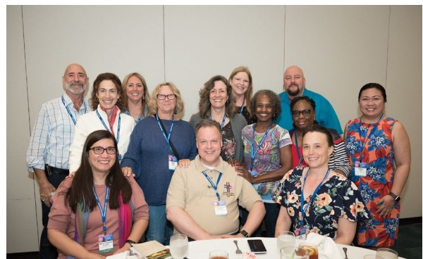
CSCP Members attend a luncheon at the 2019 Caring for the Human Spirit Conference.